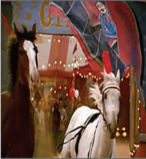
Anheuser-Busch Clydesdale Horses