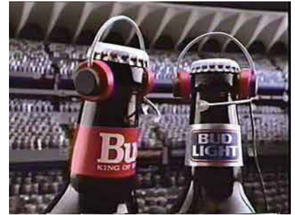
Scene from Anheuser-Busch commercial

This research should alert parents to talk to their kids about the commercials they are watching and the risk involved by using alcohol.