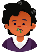
Coryza (runny nose)