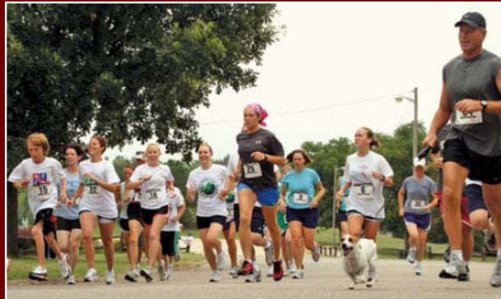
Runners take off during the Run for Rabies hosted by the student chapter of the AVMA at Kansas State University.