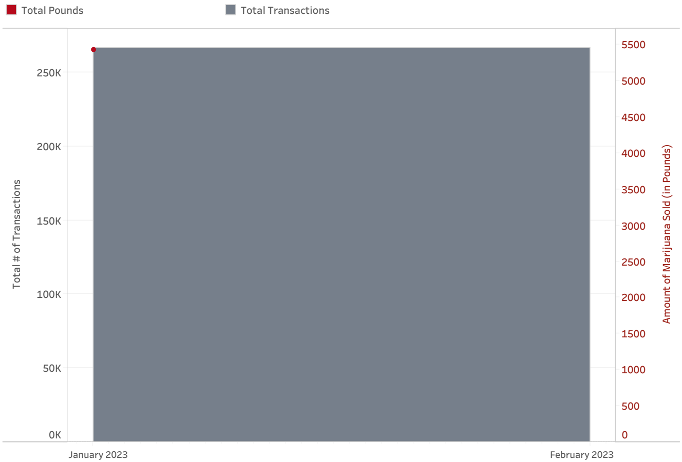
Figure 2. Arizona Medical Marijuana YTD 2023 Transactions and Pounds Sold