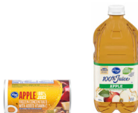
Kroger (includes apple cider)