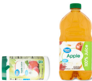
Great Value (includes honeycrisp and organic)