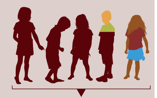
of Arizona 3rd graders need Dental Sealants